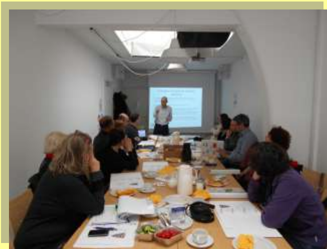
The Inclusion Network Denmark